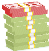
First Claim of ₹2L