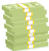
Base Cover ₹10L

Challenges don't stop, and neither should your coverage. Restore your coverage as many times as needed in a policy year for both related and unrelated illnesses, providing unlimited care for you and your family.